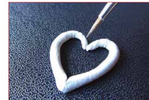
8. Shaping clay