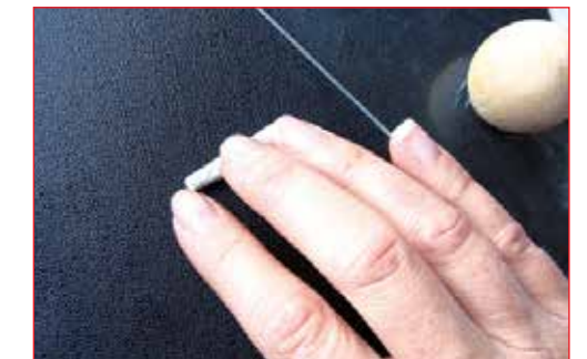
6. Rolling clay