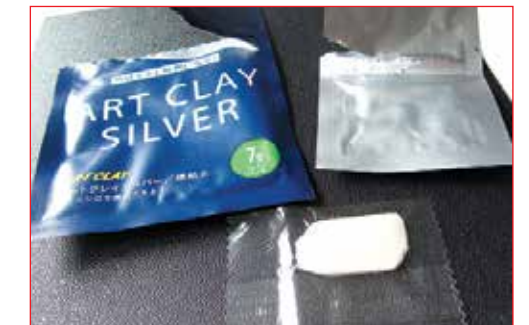
3. Silver clay