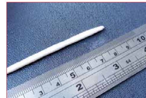
7. Rolling clay