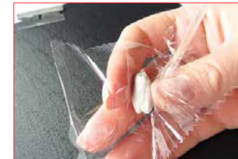
5. Prepping clay