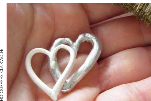
12. Brass brush