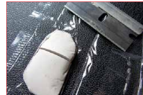
4. Measuring clay