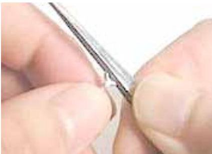
Step 1 Start by bending your eyelet so the hook is now at an angle.

Fine Silver Eyelet Pliers Art Clay Silver 650 Clay - 10gm Mould Anti-stick Solution Sanding Pad Set Firing Method Brass Brush Pro-polishing Pad Phone Charm Cord