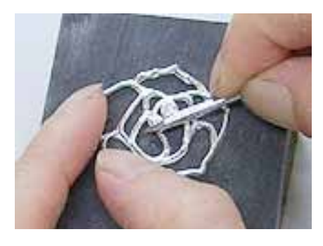
Step 7 Once dry, fire and finish your piece. You can finish your piece in a few different ways. Here its with a burnisher.