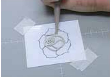
Step 2 onto your design.