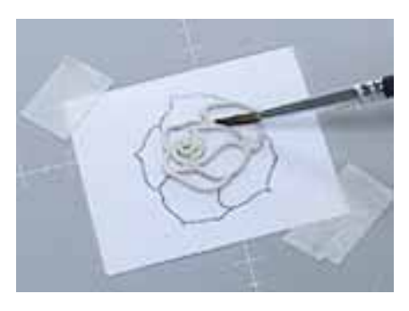
Step 4 unpositioned syringe lines using a damp brush.