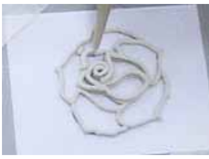
Step 5 You can fix and amend any stray or Once you have completed your Fill any gaps in the side of your design, extrude another layer on piece (between the syringe lines) top of the first. (This will give your using some paste. piece the strength it needs).